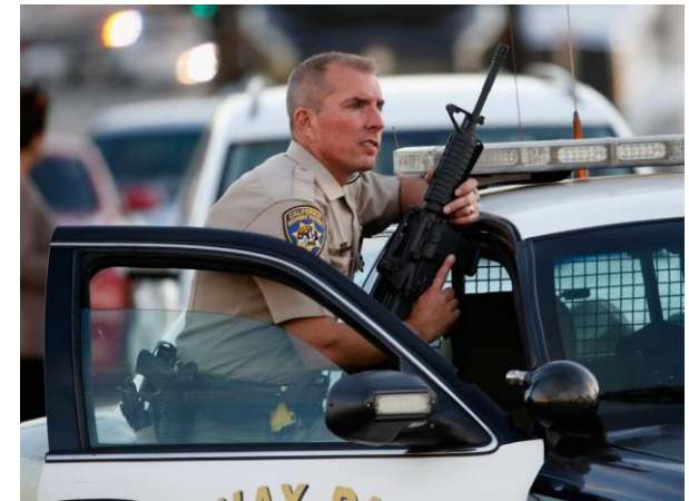
California's Highway Patrol uses Etherstack Technology